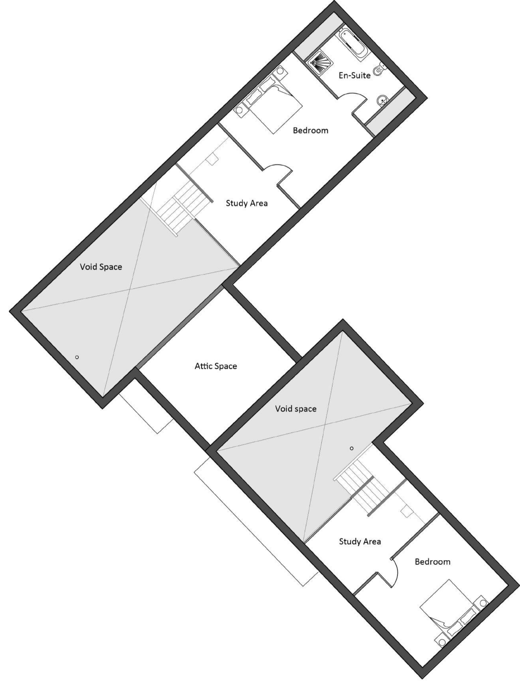
1_100 First Floor Plan

Garden Space Houses create private garden space Trees enclose the space from the railway