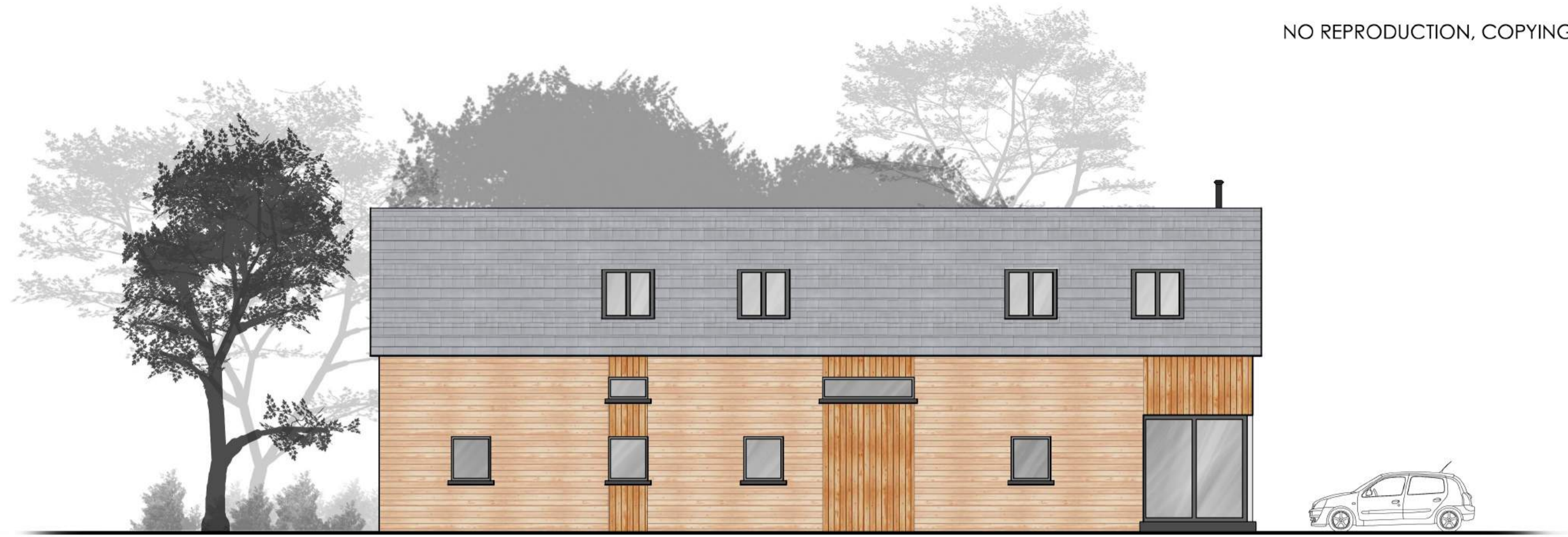
1_100 West Elevation