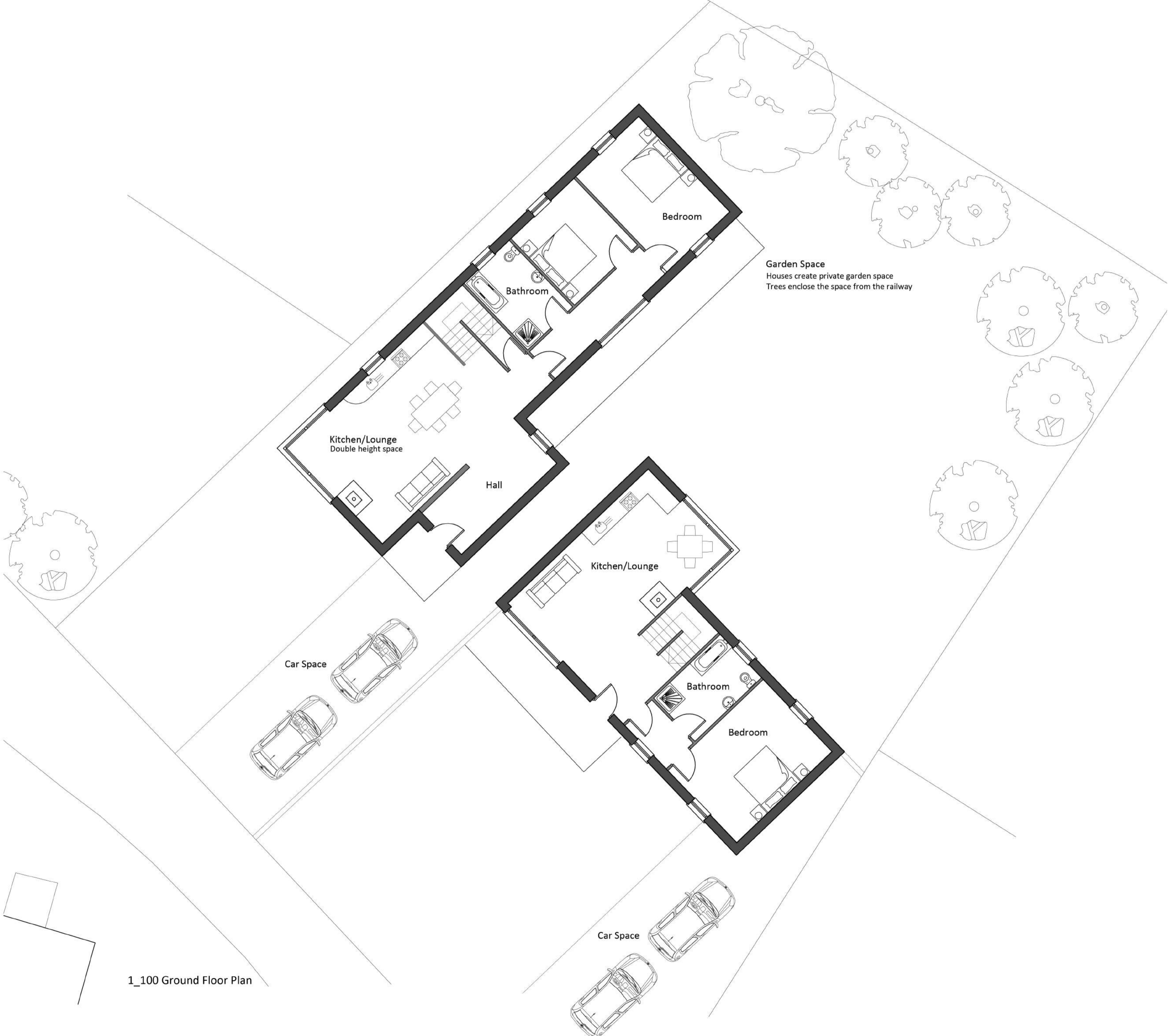
1_100 Ground Floor Plan

Garden Space Houses create private garden space Trees enclose the space from the railway