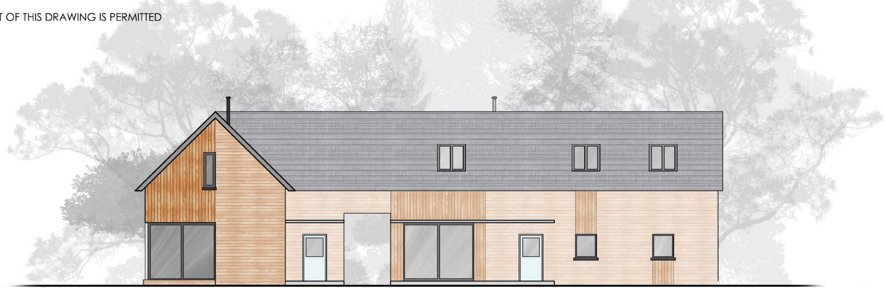
1_100 South Elevation