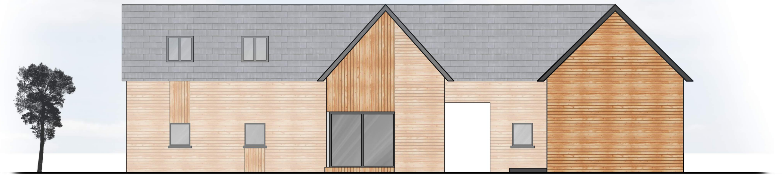
1_100 North Elevation