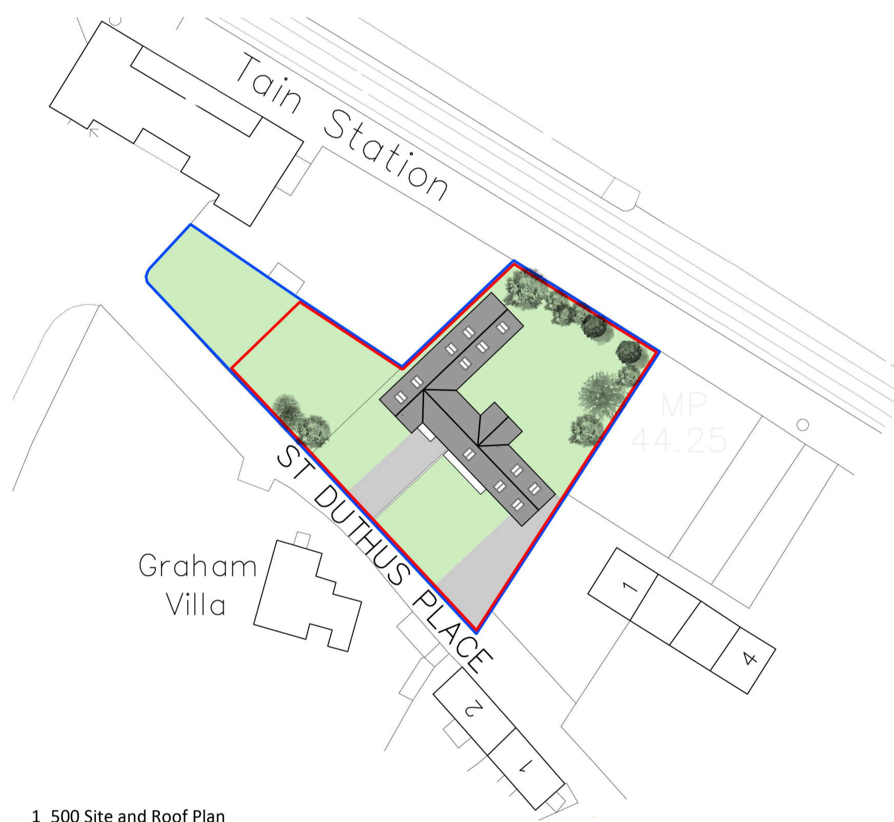
1_500 Site and Roof Plan