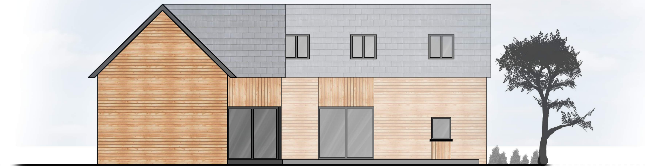
1_100 East Elevation